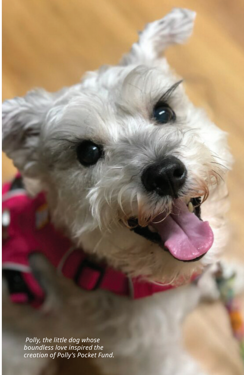
Polly, the little dog whose boundless love inspired the creation of Polly's Pocket Fund.

Polly's family said they'll always be grateful for the final year they had with Polly after her cancer diagnosis. This fund is a way to both honor Polly and help families in need facing a costly surgery or procedure that could change the life of a cherished pet. To them, every animal helped is another member of "Polly's Pack."