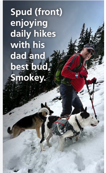
Spud (front) enjoying daily hikes with his dad and best bud, Smokey.