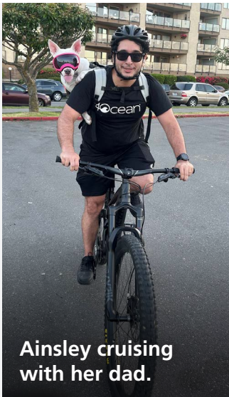
Ainsley cruising with her dad.

Ainsley came to Seattle Humane via a Lifesaver Rescue transfer from a New Mexico shelter. Eager to explore her new surroundings, she put her best paw forward and was adopted three days later. Go Ainsley go!