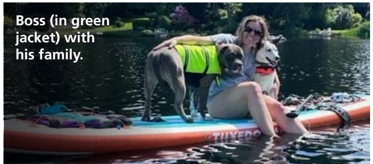
Boss (in green jacket) with his family.