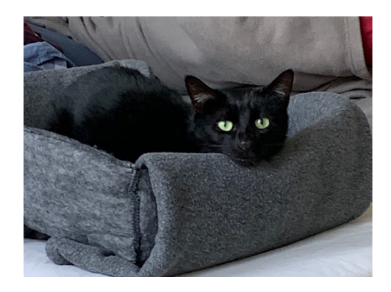
Cat Nyx flew in on the historic Wings of Rescue flight from Hawaii. "She's AMAZING, I'm utterly besotted," writes her new dad. "Thank you so much to everyone who helped bring this magical creature into my life!"

The picture began to shift in late October, when Seattle Humane and nearly a dozen other shelters participated in Paws Across the Pacific, an historic rescue flight that brought more than 600 dogs and cats to the Northwest from overcrowded shelters on five of the Hawaiian Islands. It was the first out-of-state transfer from Hawaii since March.