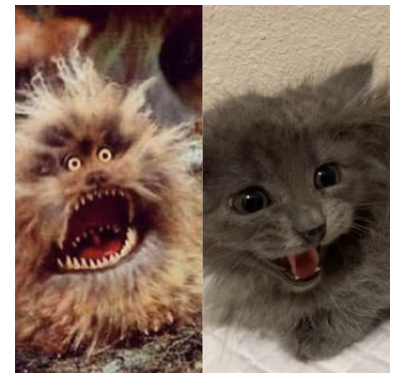
Fizzgig and doppelgänger Femi