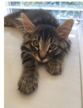
Boris the kitty