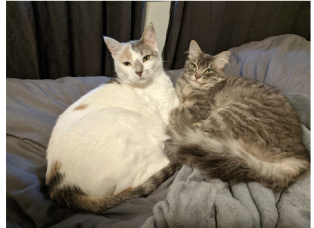
Aeris and Sprout