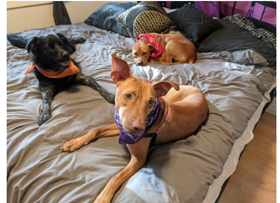
Zulu, with fosters Purple Rain and Blue Monday