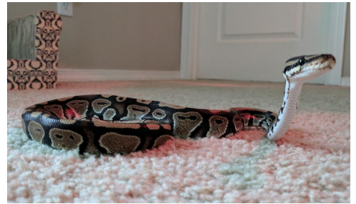
Al dente the Snake