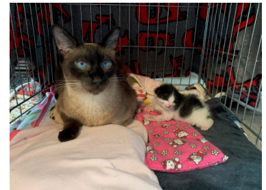
Cuddles with current foster kitten Moose