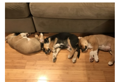
Henry (right) & his littermates