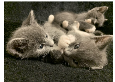
Washington, Hamilton, & Jefferson